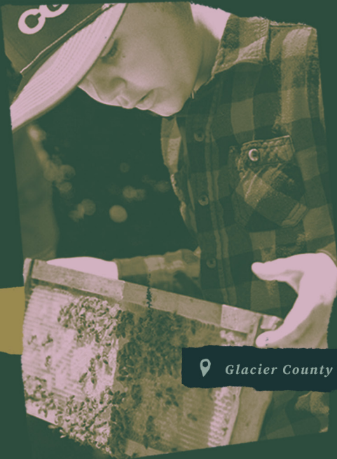
Glacier County CD