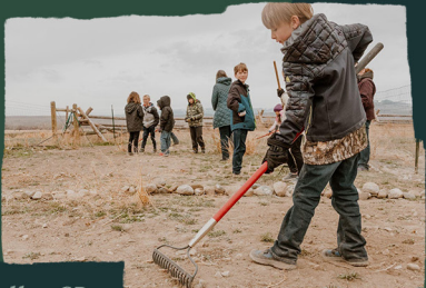
Ruby Valley CD