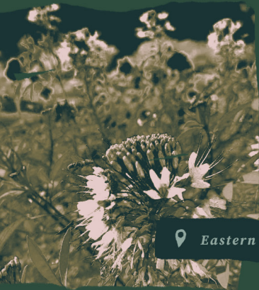
Eastern Sanders CD