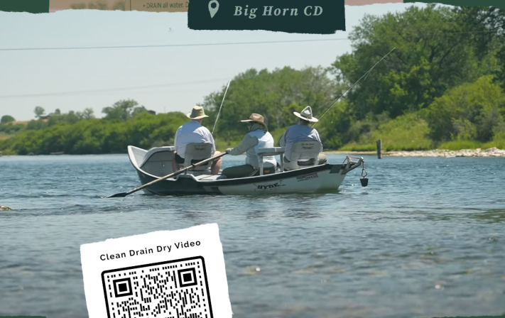
Big Horn CD