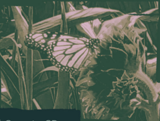
Hill County CD