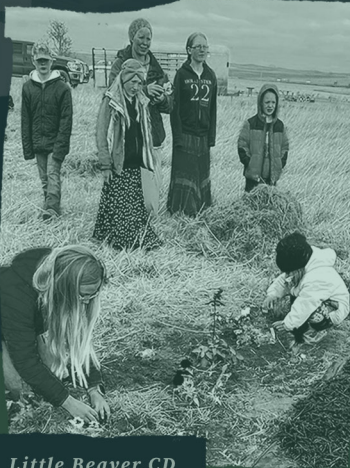
Little Beaver CD